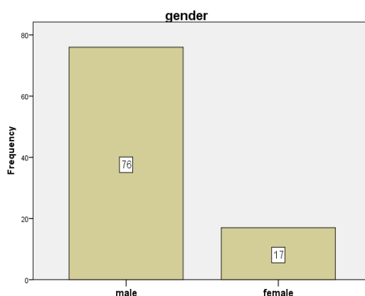
Fig.1: Gender (sample demographics)

Concerning the sample demographics, the average age of the participants was 33.2 years, with the youngest respondent to be 17 years old and the oldest one 55 years old, while an 81.3% of the respondents were males and an 18.7% were females.(fig. 1)