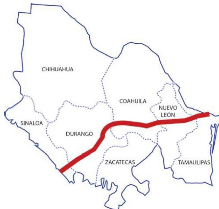
Figure 1. Location of Northern Economic Corridor.

The states of Chihuahua, Nuevo Leon, Durango, Coahuila, Tamaulipas, Sinaloa, Zacatecas and Nayarit, make up the area where the Northern Economic Corridor is located. In Figure 1 is observed his geographic location. This region accounts for 60% of trade flows in North America and is a market of more than 21 million people. Its GDP per capita is US $ 9,505, which is higher than in Colombia, five times higher than that of India and 70% more than the Philippines. Upon completion of the entire infrastructure of the Corridor, they may be transported goods from Asia to the North American market (Conferencia Nacional de Gobernadores, 2014).